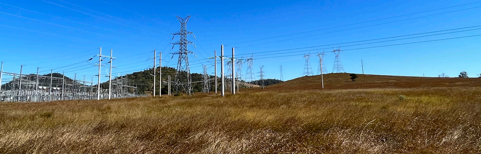
Existing Woolooga Substation